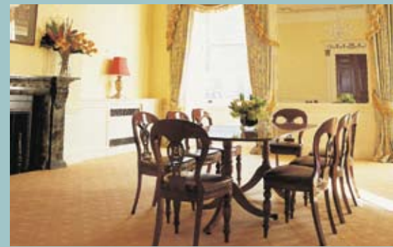
THE ADAM ROOM