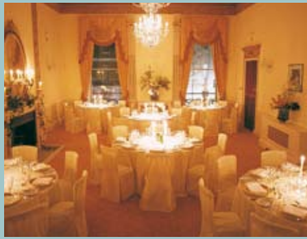
THE HEGGIE ROOM