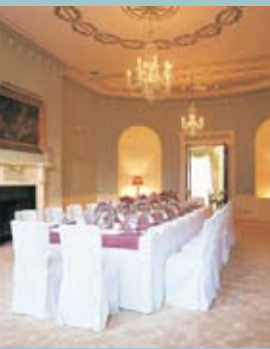
THE SAINSBURY'S ROOM

Traditional elegance and modern luxury in the heart of London's West End