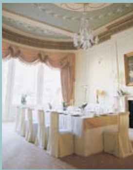
THE HARBEN ROOM